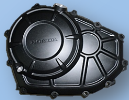
COVER CRANK CASE