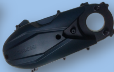
COVER L SIDE