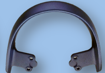
RAIL RR GRAB